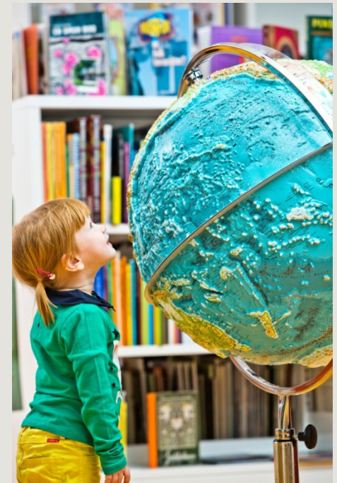
Odense Library